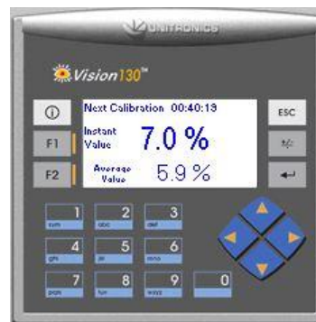
EMS412 EPA Compliant Opacity