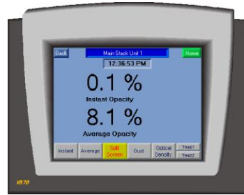
EMS422 EPA Compliant Opacity

EMS manufactures some of the most accurate and reliable Opacity Monitors in the industry. Our "EPA Compliant" Opacity Monitors feature auto zero/span mode which accurately checks the range and linearity of the instrument. With a minimal amount of moving parts, our Opacity and Dust Monitors are designed for a long life of trouble free operation.