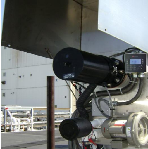
EPA Compliant Opacity Installation